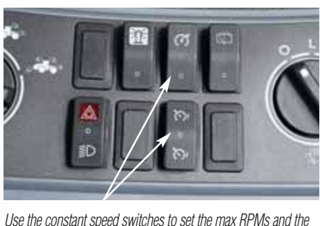
Use the constant speed switches to set the max RPMs and the speed adjustment switch or throttle to return engine speed to the desired level after making a turn.